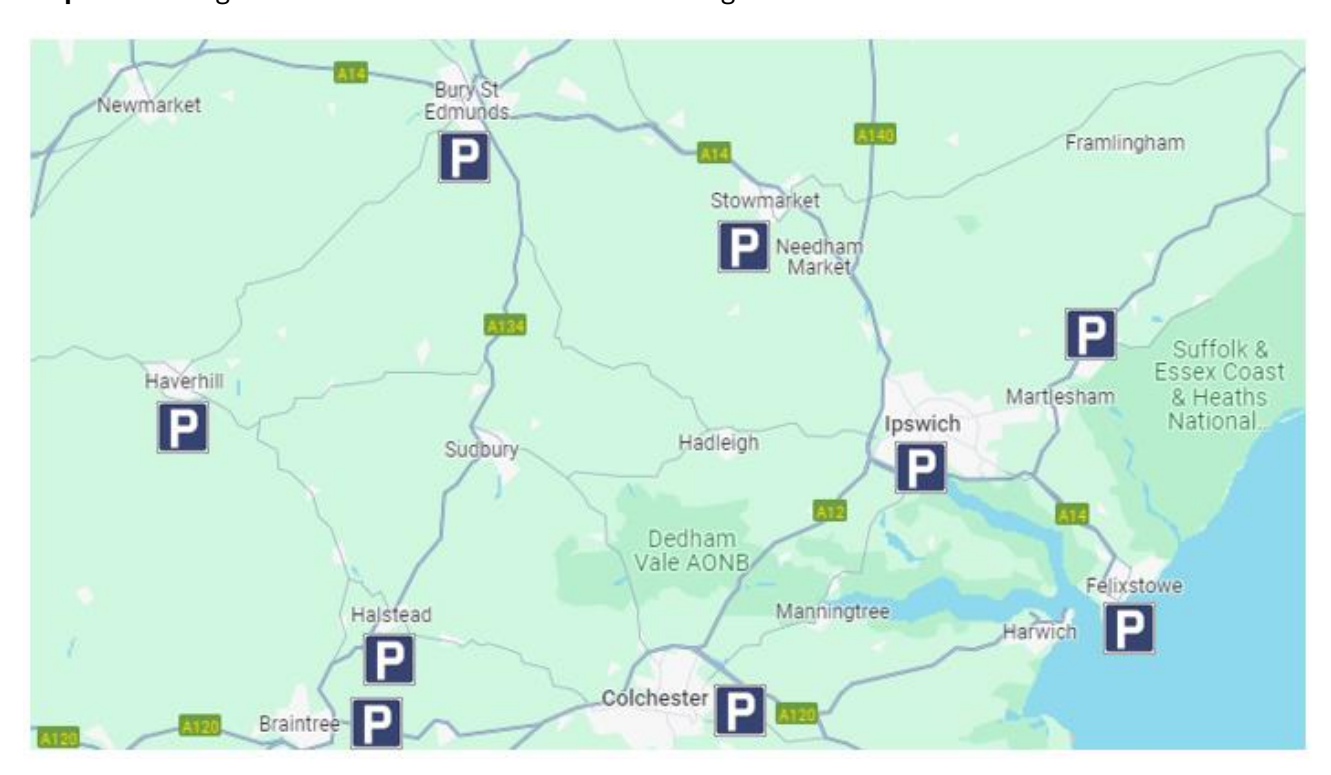
Table 3 - Local Authorities in East Anglia that offer free car parking.